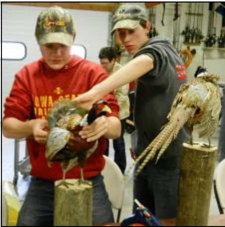
Participants mount a pheasant at our taxidermy workshop this fall.