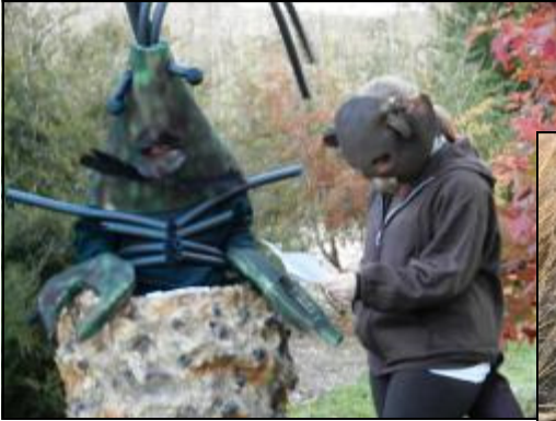
Over 100 people participated in our Halloween Hike! Left: crayfish & river otter, Below: red foxes