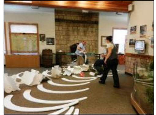
Staff enjoy putting together the giant snake skeleton—just one very large puzzle!