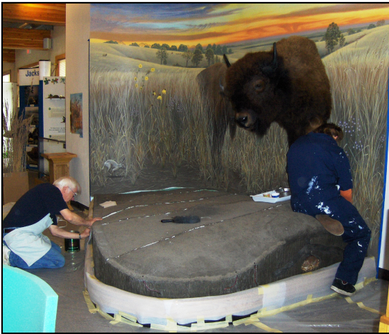
Environmental Arts working hard installing the new prairie exhibit.