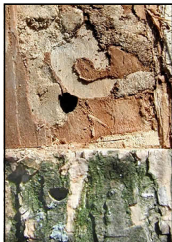
D-shaped exit hole.

Damage by EAB populations typically go undetected until ash trees show symptoms. Larva feeding interrupts the transport of nutrients and water within the tree during the growing season. Tree leaves wilt and the canopy thins as branches die. Infested trees lose more than 30% of the canopy after 2 years of infestation and trees often die after 3-4 years of EAB activity.