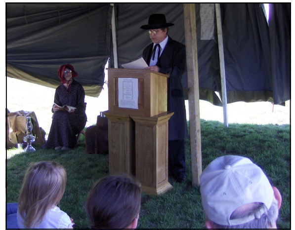
The Visitor from the Past Program was a huge hit as participants learned about Iowa in 1846.