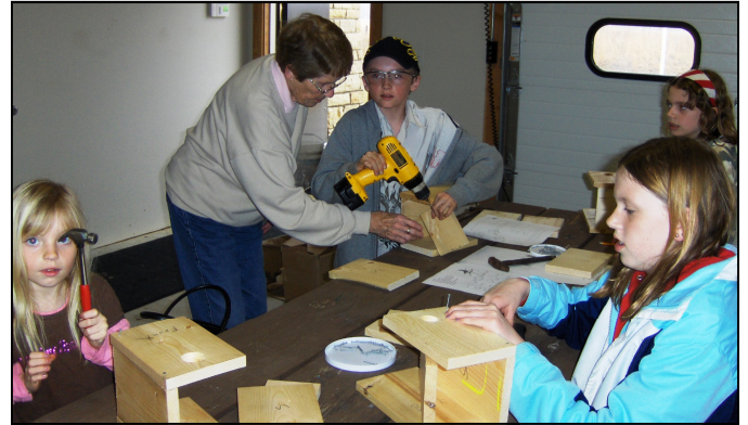
Participants enjoyed building birdhouses to take home for the birds in their backyards.