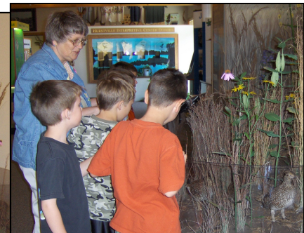
Delwood 2nd graders learned what Iowa looked like as settlers were first arriving.