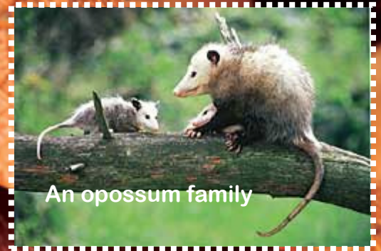
An opossum family

Females have litters up to twice a year. The father doesn't help raise them. There are usually 5 to 8 in a litter and are ready to leave their mother's pouch and live on their own at 4 months.