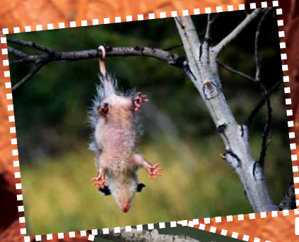
Baby opossum hangin' out!