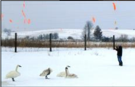
Derek is putting up orange flagging over the swan pen to discourage wild swans from flying in. Job is best done in the winter when we can walk on the ice.