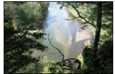
Make sure to hike to the overlook for a great view of river!

Hiking, picnicking, stream fishing, hunting, paddling, primitive camping, geocaching, wildlife viewing, and birding are all popular activities at Buzzard Ridge. This area is a convenient stop for canoeists traveling down the Maquoketa River and great for those looking for camping along the river (pit toilets on-site).