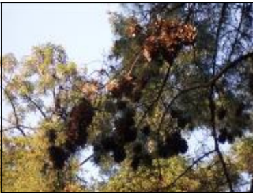
Thousands of Monarchs gather on single trees in large clusters.

Just this month (August) the question of where that female had been tagged and released was answered. And amazingly she was tagged at the Bickelhaupt Arboretum in Clinton, IA. Again, what are the odds?! Of all the hundreds of people who tag monarchs each fall and of all the millions of monarchs in the reserves in Mexico; I managed to spot one that had been tagged practically “next door”!