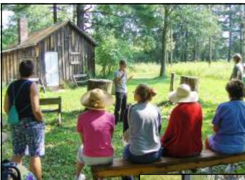
Several people from the area joined our staff for a trip to Baraboo, WI to see the International Crane Foundation and the Aldo Leopold Legacy Center this past month.