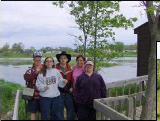
DAC Dayhab enjoyed a guided nature hike along the prairie and marsh!

Youth try their hand at archery, Frisbee golf, canoeing, fly fishing, and more at Youth Outdoor Skills Day.